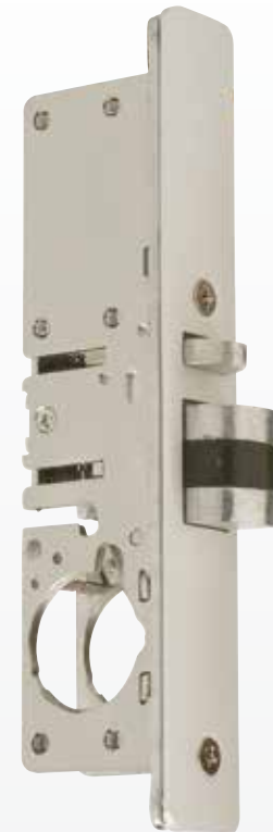
524510 Lock Type